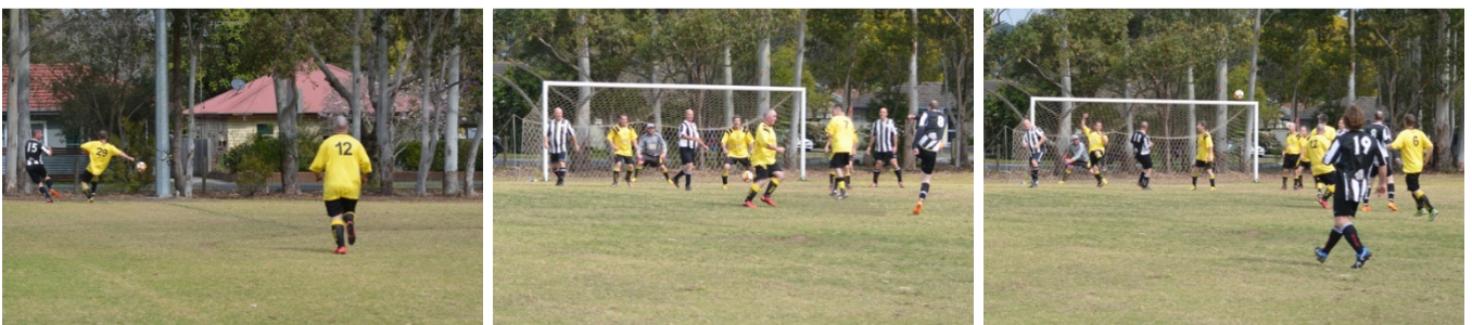
(^) A KILLARNEY shot comes close to bagging their third.