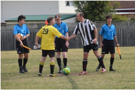
(^) Ready with dueling water bottles.