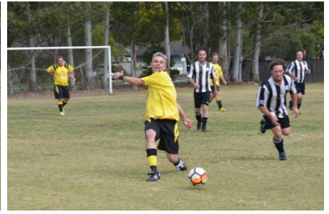
(^) KEEP CALMMMMMMMMMMMM!