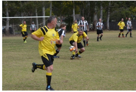
(^) Keep Calm !