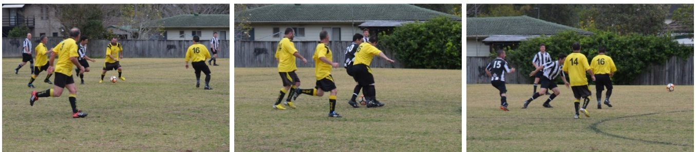
(^) SNORKY makes his presence known early on .