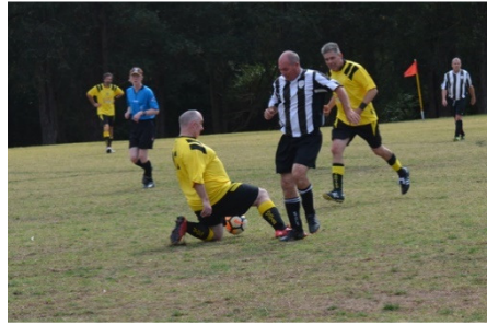
(^) Please don't try and kick it right now