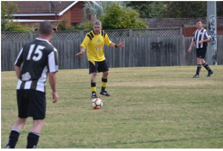
(^) Keep Calm.