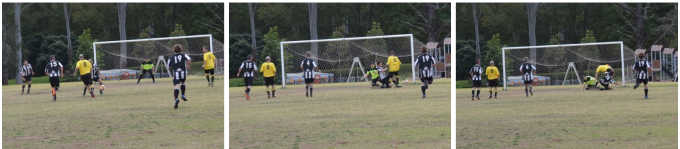
(v) NEWNHAM almost connects to MICK's through ball