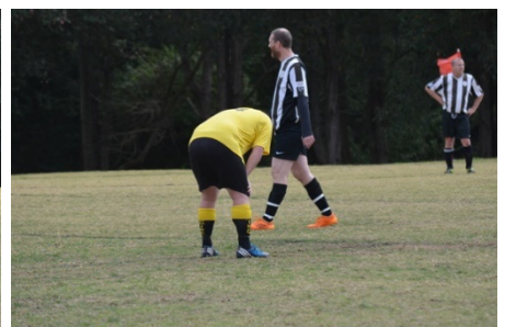
(^) Here comes breakfast