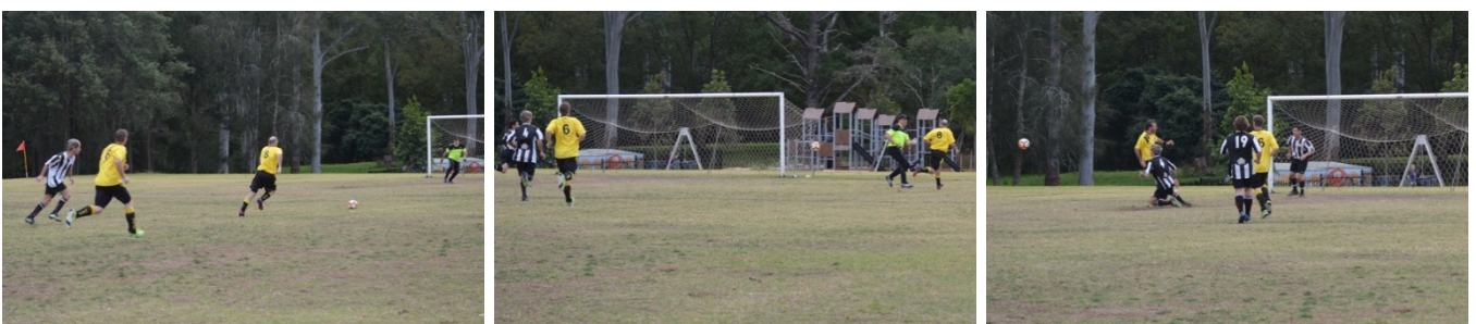
(^) MICK's shot takes a deflection and almost finds ANDY.