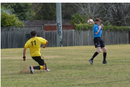
(^) That's for not seeing the flag was up!!