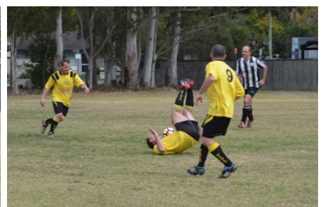
(^) That Damn Invisible Sniper !!