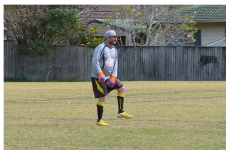
(^) Gloves not ideal when chaffing