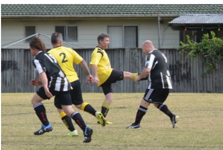
(^) A Cinderella Story.