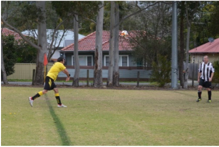
(^) Pfft, foot barely over the line !!