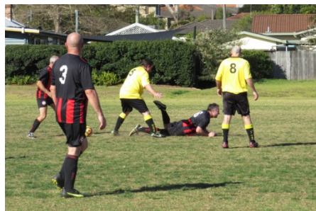
(^) Failed Wheelbarrow Attempt #2