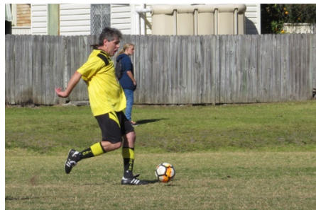
(^) "Get Her Off Me!!!!"