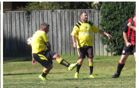
(^) A Swing and a Miss