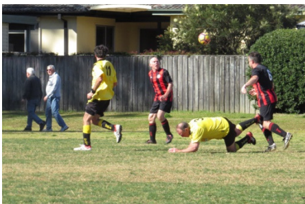
(^) Failed Wheelbarrow Attempt #1