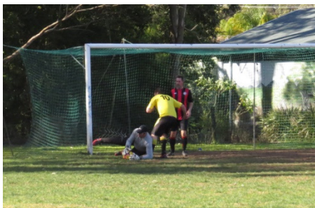
(v) STEW heads a beautiful cross from CHRIS over the crossbar.