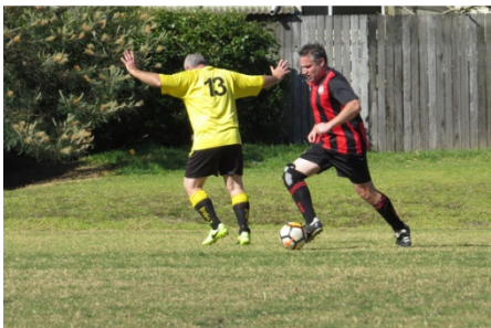
(^) Jazz Hands.