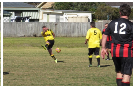
(^) A Swing and a Miss