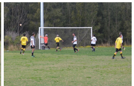
(^) LUCA's free kick flies away.