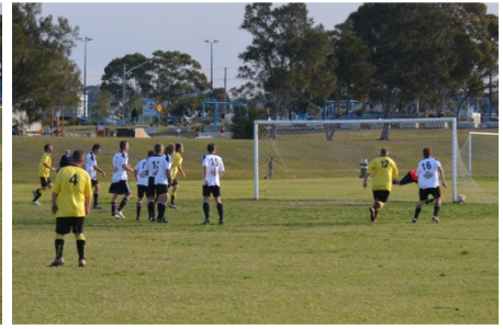
(^) MICK's free kick veers wide.