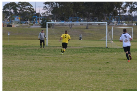
(^) KLLARNEY almost in again !!