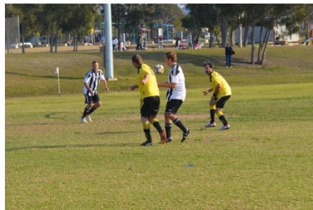
(v) CHRIS unable to connect with an ANDY cross.