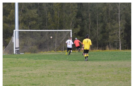
(^) STEW makes an attacking run down the right flank.