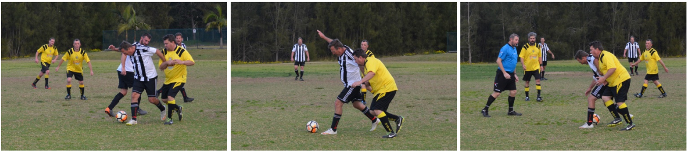
(^) FLANNO re-enacts a scene from the movie Jaws.