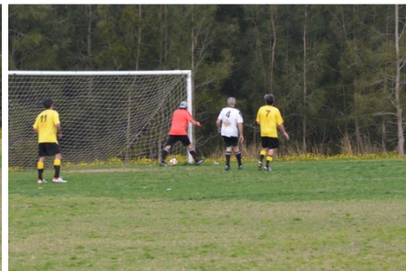
(^) FITZY's tap from a MICK cross veers wide.