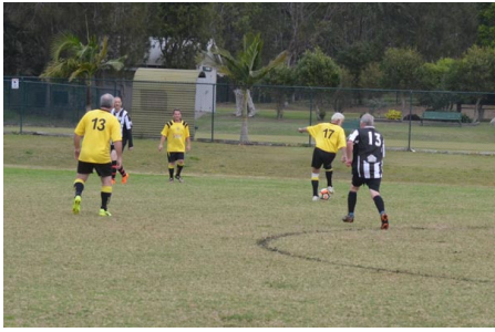
(^) Some BILLY magic