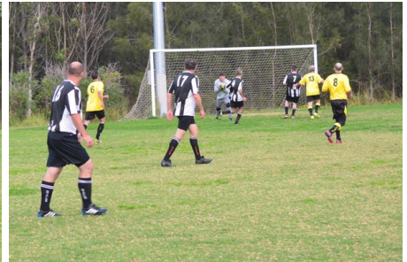
(^) ANDY takes the wrong option ... a failed cross rather than pass it to the unmarked dog.