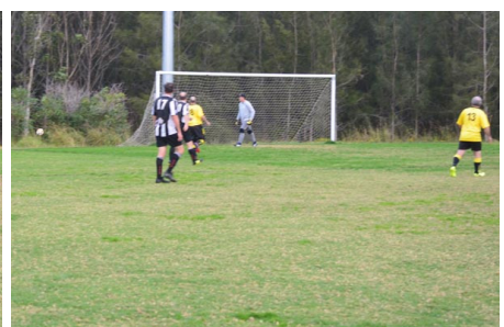
(^) KENNO's shot in the first minute veers wide.