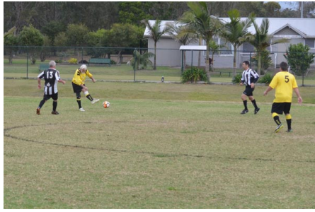
(v) HOWZAT!! STEW appeals on a foul on KENNO.