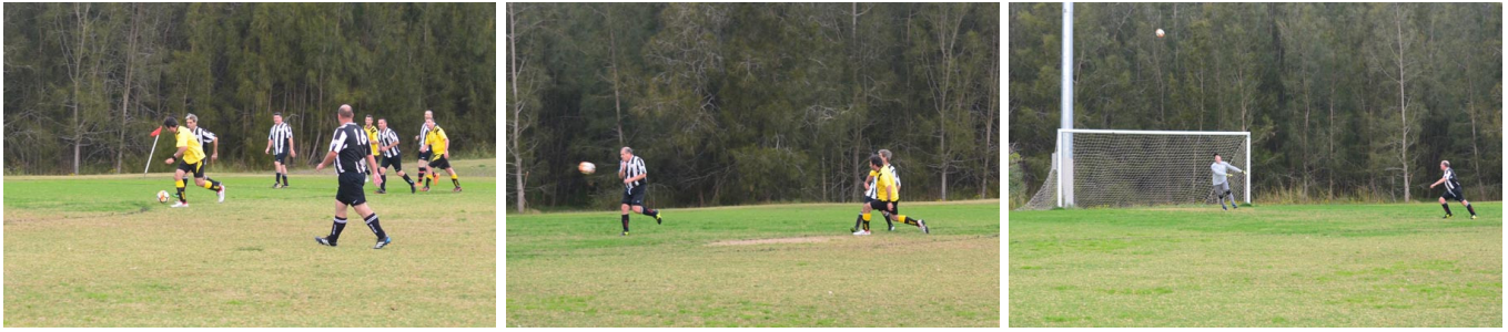
(^) ANDY's shot is blocked by the keeper (Repeat, Brad & Meady, that is a block not a shot sailing over the crossbar !!)