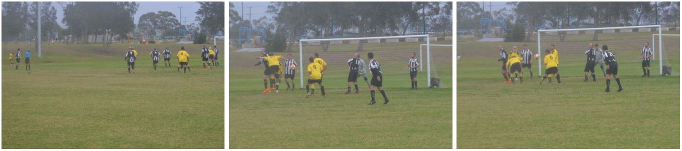
(^) MEADY's header attempt.