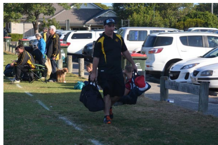
(^) DALE arrives a tad too late.