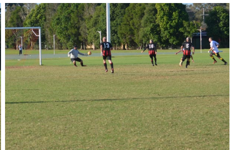
(^) Wyong's keeper blocks a shot from BEN.