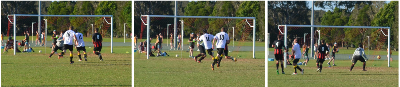
(v) ANDY's hits the post