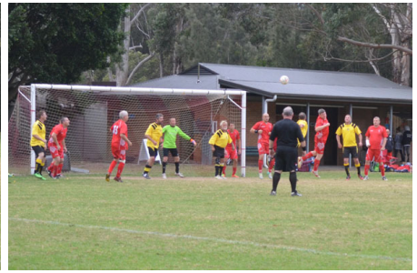
(^) MEADY is heads up for an ANDY K corner (v) DALE has a dig.