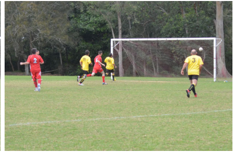
(^) GOSFORD claims their fourth.