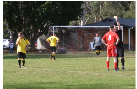
(^) Early tension as WALLACE DA GRUB & GOSFORD'S #8 get involved in some fistcuffs and thumb wrestling