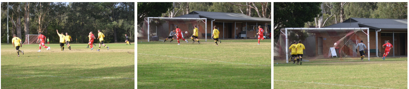
(⤴) GOSFORD'S First Goal ...