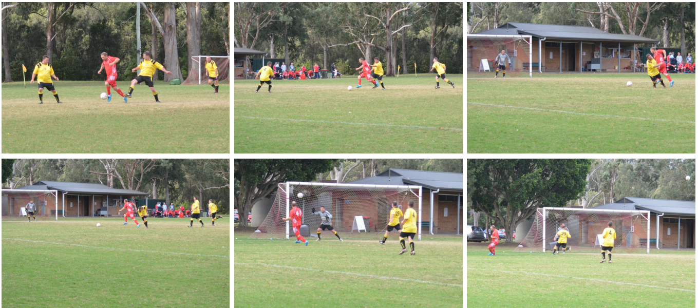
(⤴) GOSFORD's first real chance is thwarted by the crossbar.