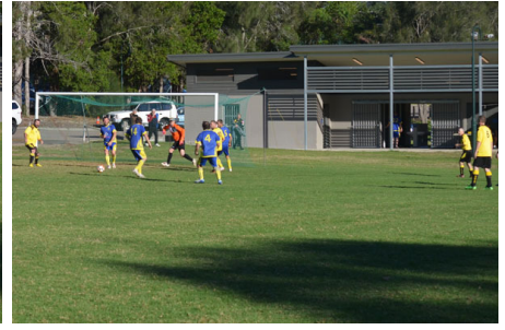
(^) MICK troubles the defence.