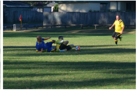
(^) NIGE cuts down an attacking run.