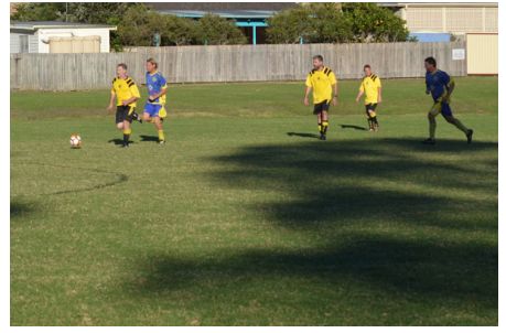
(^) MEADY turns defence into attack