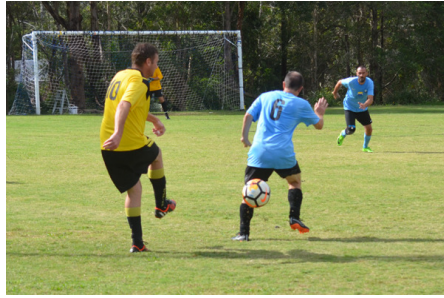
(5) THE KICK UP THE BUM