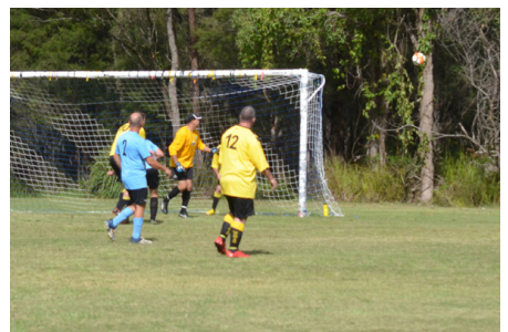
⤴ STEW takes a shot.