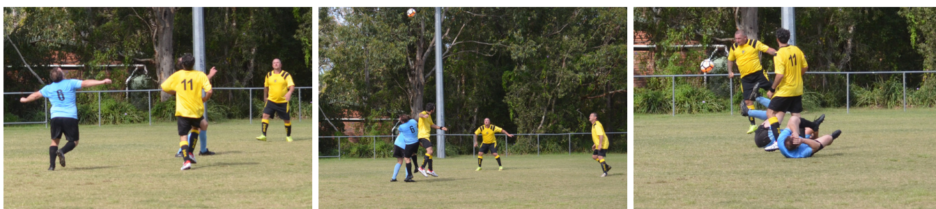
⤴ A nasty head clash between two Berkeley players.