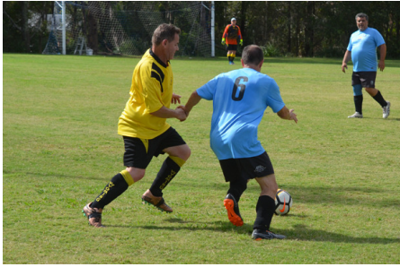
(4) HAND HOLDING