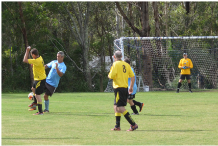
⤴ STEW keeps digging away into the goalmouth but his shot is blocked.