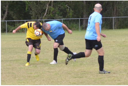
(1) THE SIAMESE TWIN POSE