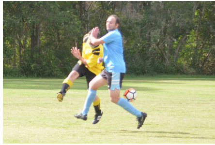
(2) THE FACE PLANT