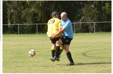
(3) THE BUM GROPE