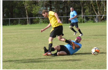
(6) THE BELLY TICKLE