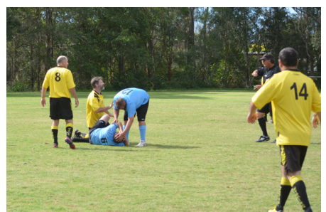
⤴ A collision with the MEAD!