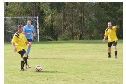
⤴ "It's the Battle of the Four-Footers" (an excerpt from Brad's On-Field Banter Highlights)