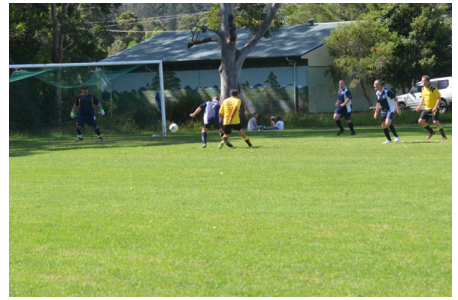
⤴️ LUCA's cross sails across the goals awaiting an easy tap in.