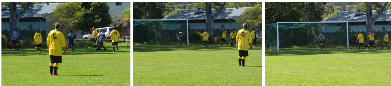
⤴ OURIMBAH takes the lead.