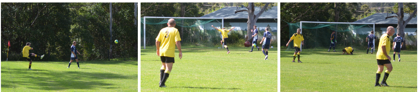
⤴ STEW just misses connecting with a cross from ANDY K ⤵ ANDREW almost connects with MICK's free kick