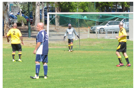
⤴️ OURIMBAH almost make it 3-3. Their shot veers just over the crossbar.