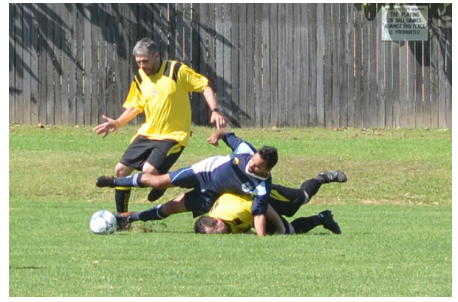
TIGER & FALCON BONDING