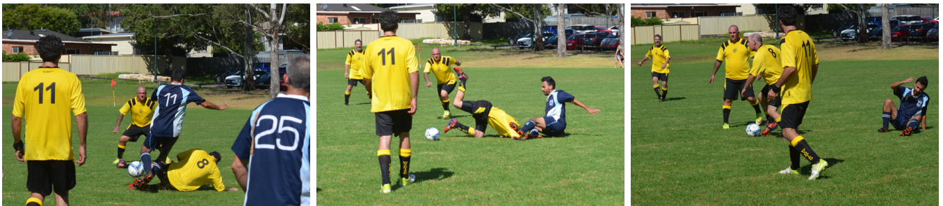
⤴ The Slide Tackle is Back !!