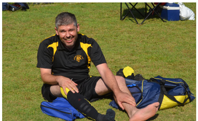
⤴ Poor LUCA arrives just a little too late