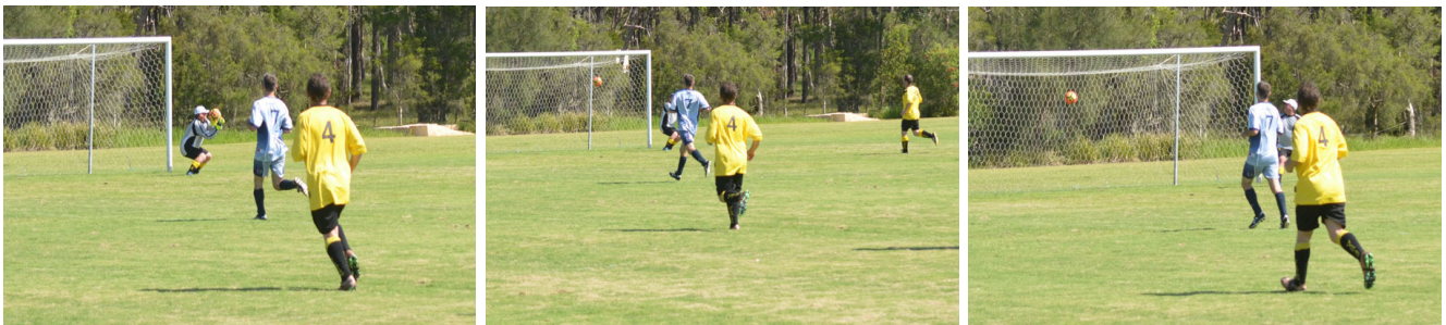
⤴ "Ahoy, me Hearties" ... the one that got away [WOONGARRAH GOAL #2]