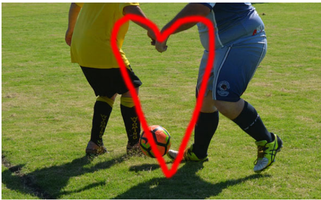
⤴ LOVE !!