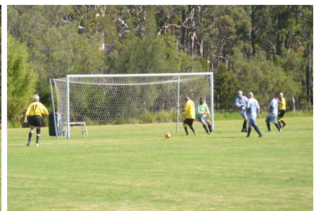
⤴ MICK sends it across the goalmouth for a perfect tap in ... BILL, what a chance !!!