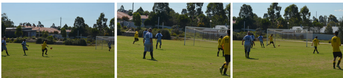
⤴ WOONGARRAH racks up their fourth goal.