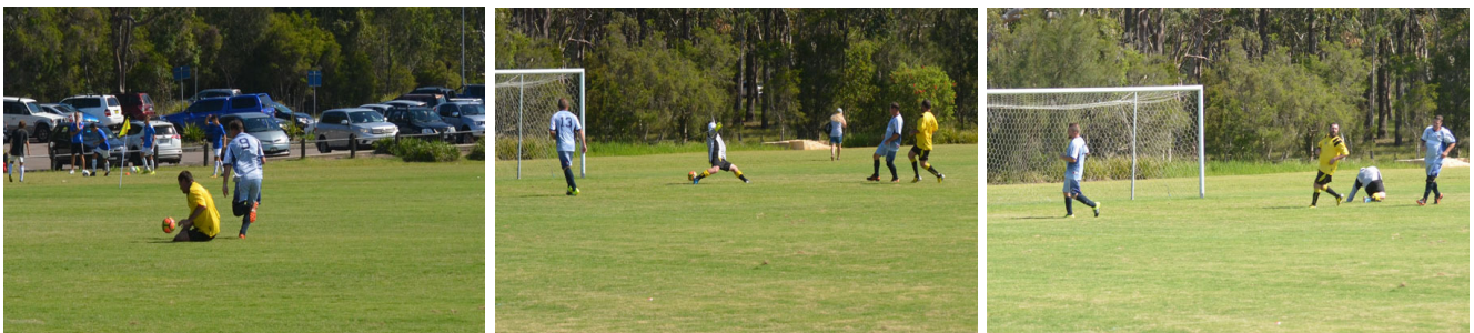
⤴ By George! I don't think he's got this ! [WOONGARRAH GOAL #3]