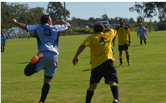
⤴ Diving practice