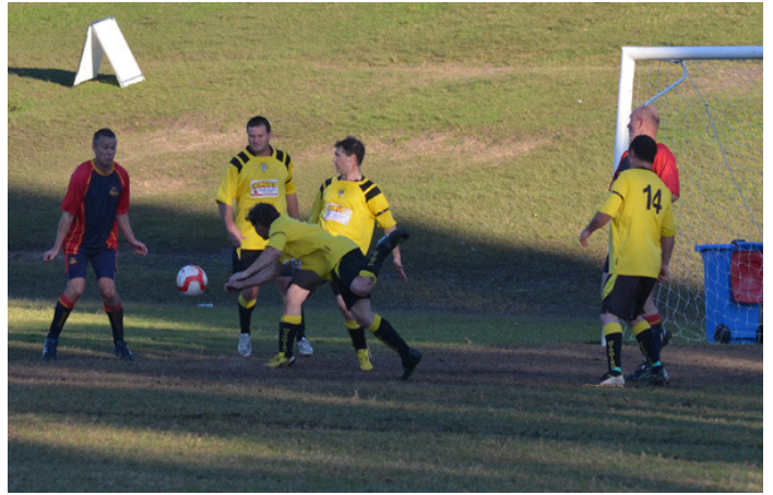
MEADY demands no more goals be conceded / MARKY makes a flying leap.