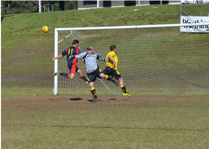
Meady: "Come on number eleven, let's run into the net together" 😊