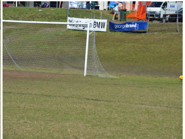
Andy goes close to scoring