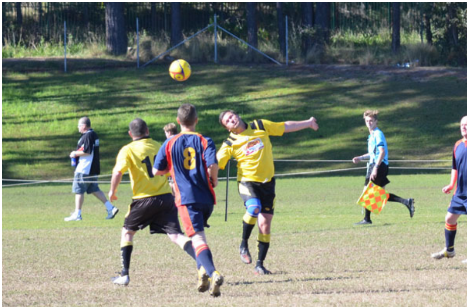
I better not make any biblical references here