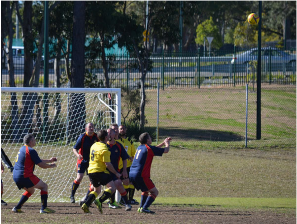
Incoming corner kick ...