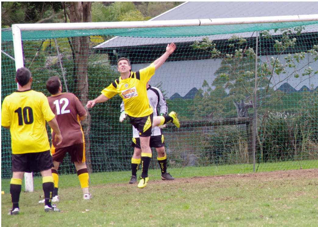
Reach for the skies !! (Note: Meady's ankle injury was not caused in this play)