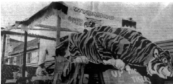
For the second year in a row Wyoming won both the Best Decorated Float and March Past awards at the 1971 CCSA pre-season Gala Day.